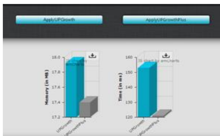
Fig 2: snapshot for showing the result after applying UP Growth and UP Growth Plus algorithm